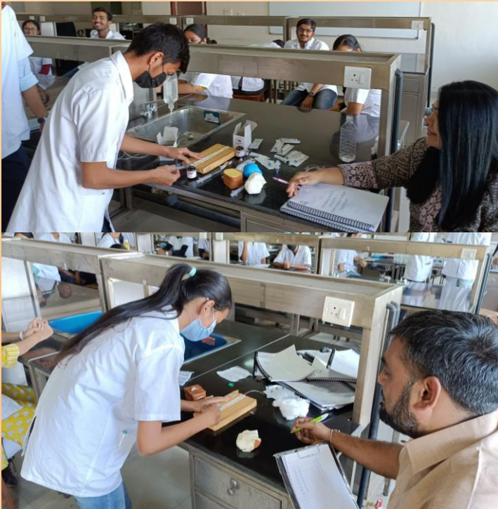
Skill Assessment of Students by Pharmacology Department