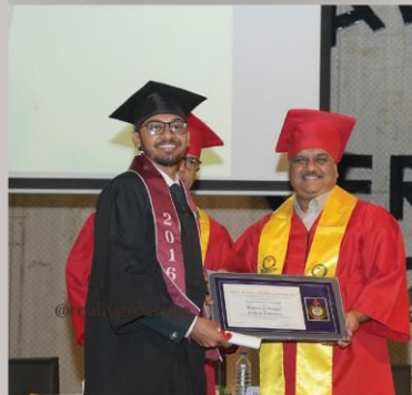
Graduation Ceremony of Batch-2016: